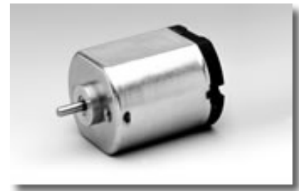
Weight: 46g (approx)