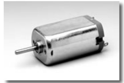
Weight: 31 g (approx)