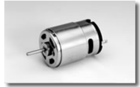
Weight: 70g (approx)