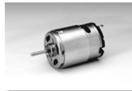
Weight: XXg (approx)