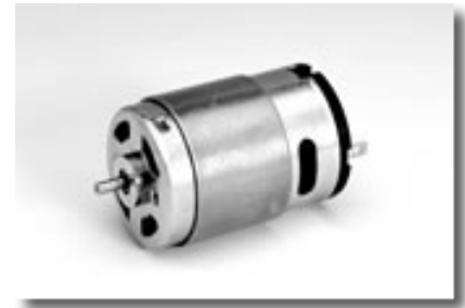
Weight: 82g (approx)