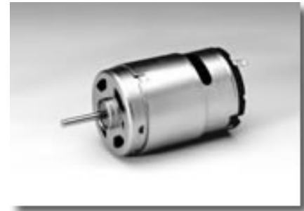
Weight: 82g (approx)