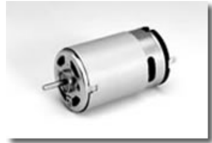
Weight: 97g (approx)