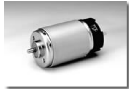
Weight: 130g (approx)