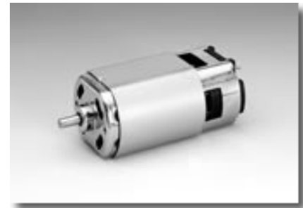
Weight: 240g (approx)