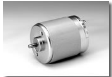
Weight: 140g (approx)