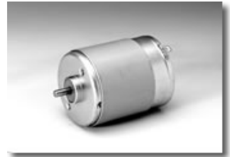
Weight: 146g (approx)