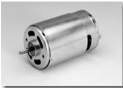
Weight: 220g (approx)