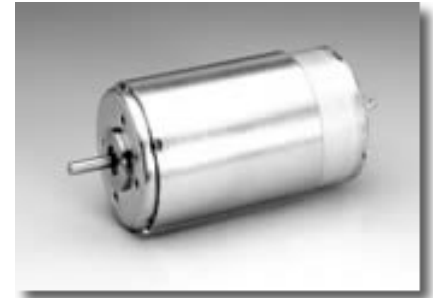
Weight: 230g (approx)