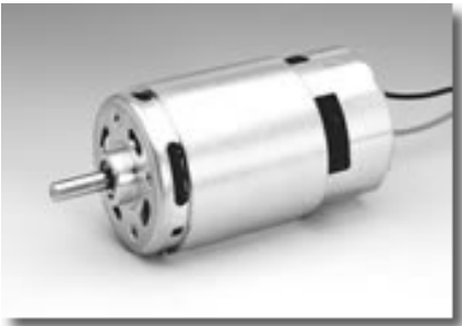
Weight: 350g (approx)