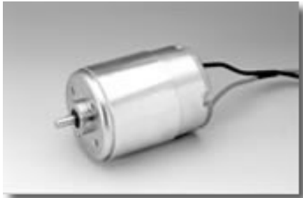
Weight: 435g (approx)