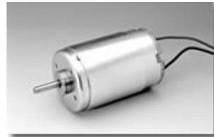
Weight: 550g (approx)