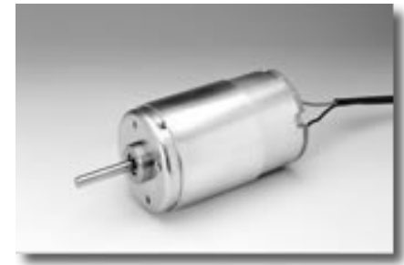
Weight: 630g (approx)