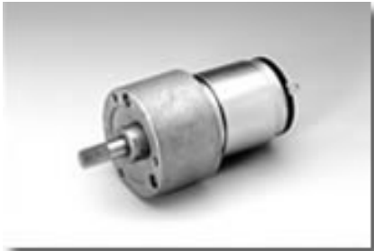
Weight: 140g (approx)

I would like more information on purchasing this motor