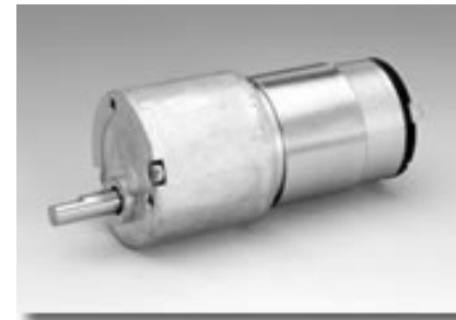
Weight: 142g (approx)

► I would like more information on purchasing this motor