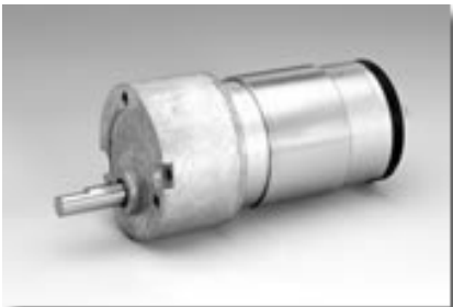
Weight: 145g (approx)

► I would like more information on purchasing this motor