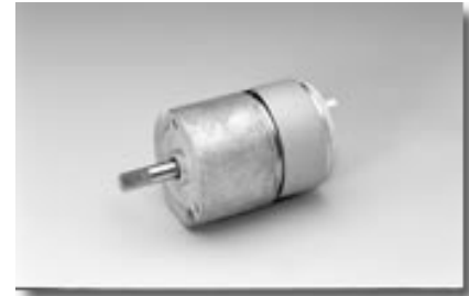
Weight: 110g (approx)

► I would like more information on purchasing this motor