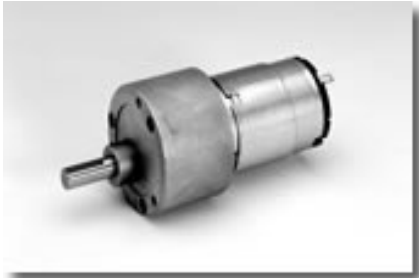
Weight: 145g (approx)

I would like more information on purchasing this motor