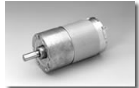
Weight: 250g (approx)

► I would like more information on purchasing this motor