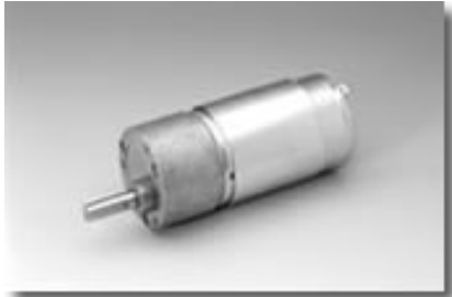
Weight: 300g (approx)

I would like more information on purchasing this motor